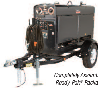
Completely Assembled Ready-Pak® Package