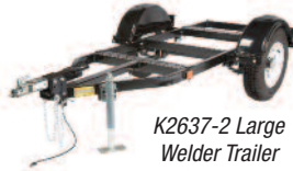
K2637-2 Large Welder Trailer